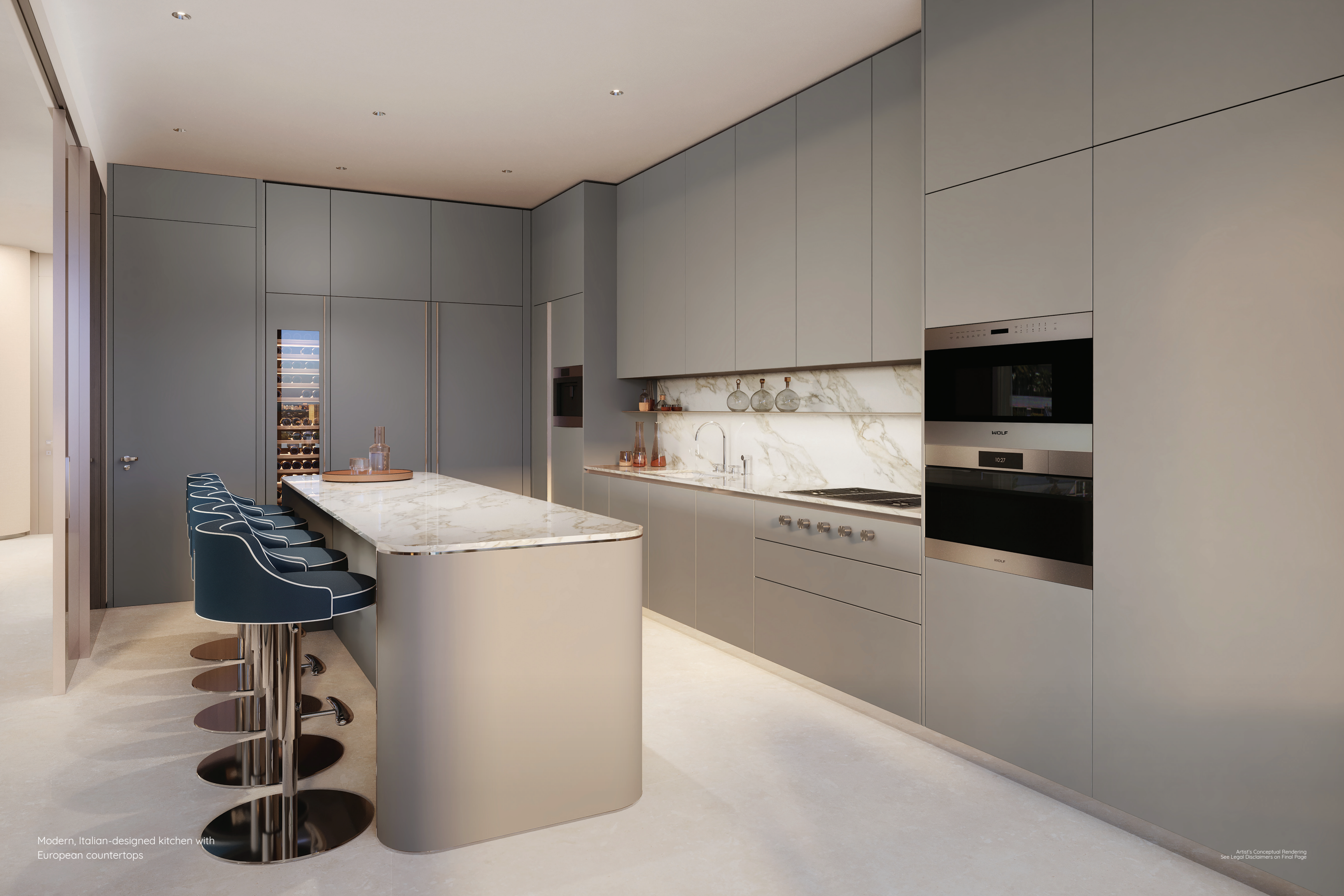
Modern, Italian-designed kitchen with European countertops