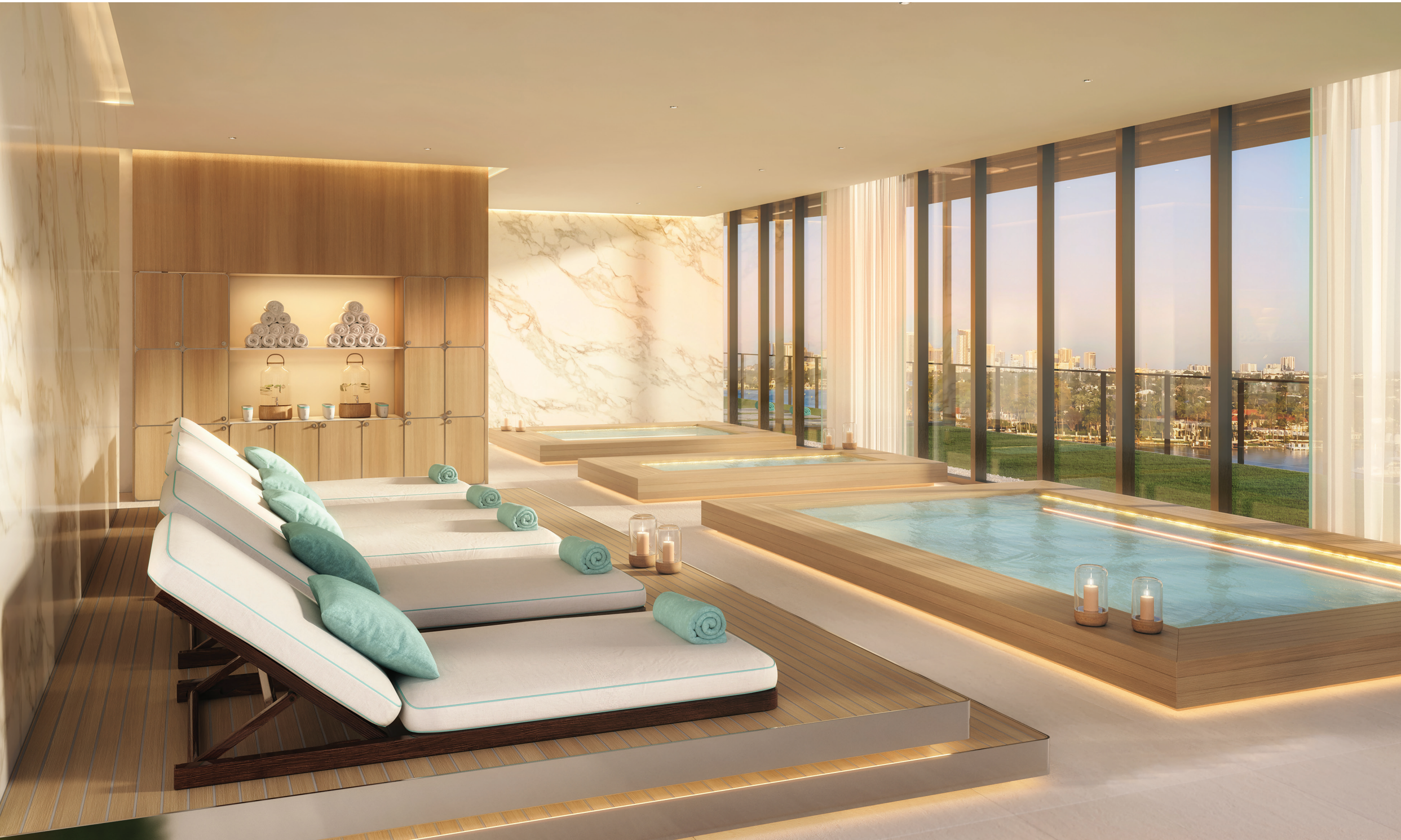
Transformative sanctuary with heated spa, steam and sauna rooms, and bespoke treatments

With over 20,000 SF of dedicated amenity space, each amenity at Riva Residence is its own unique point of arrival, thoughtfully placed and designed to create a sense of movement and balance that touches every sense. As with the streamlined, curved interiors of a yacht gliding through water, every space unfolds in a crescendo of experiences—a curated art gallery, a serene garden, a sunrise bar and lounge, a sunlit executive boardroom—all leading up to a tranquil sky lounge and sun deck.