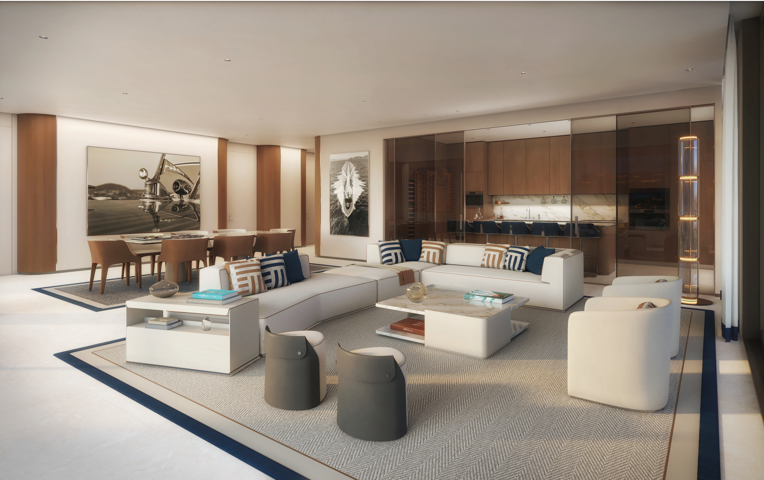
Welcoming Great Room for gathering and conversation

Riva Residenze offers 36 two-to-six bedroom luxury residences with stunning oceanfront, marina, and city views. Here, home espouses the sensibility of yachting luxury, interpreted in understated accents and a quiet, purposeful balance of lines and curves.