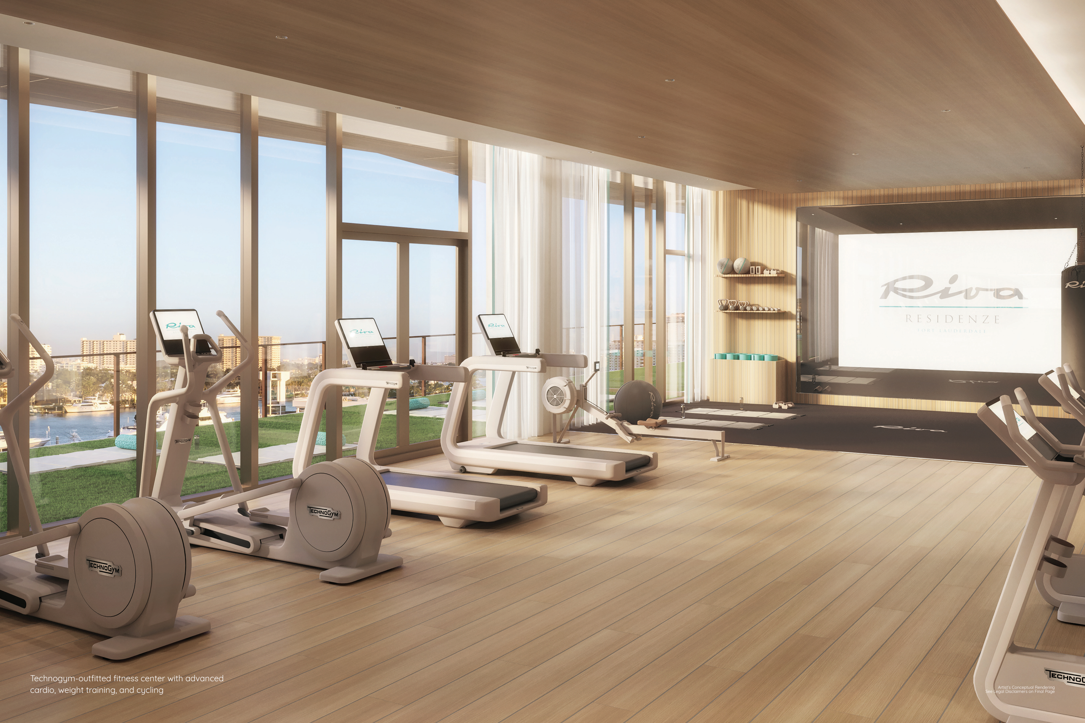
Technogym-outfitted fitness center with advanced cardio, weight training, and cycling

Artist's Conceptual Rendering See Legal Disclaimers on Final Page