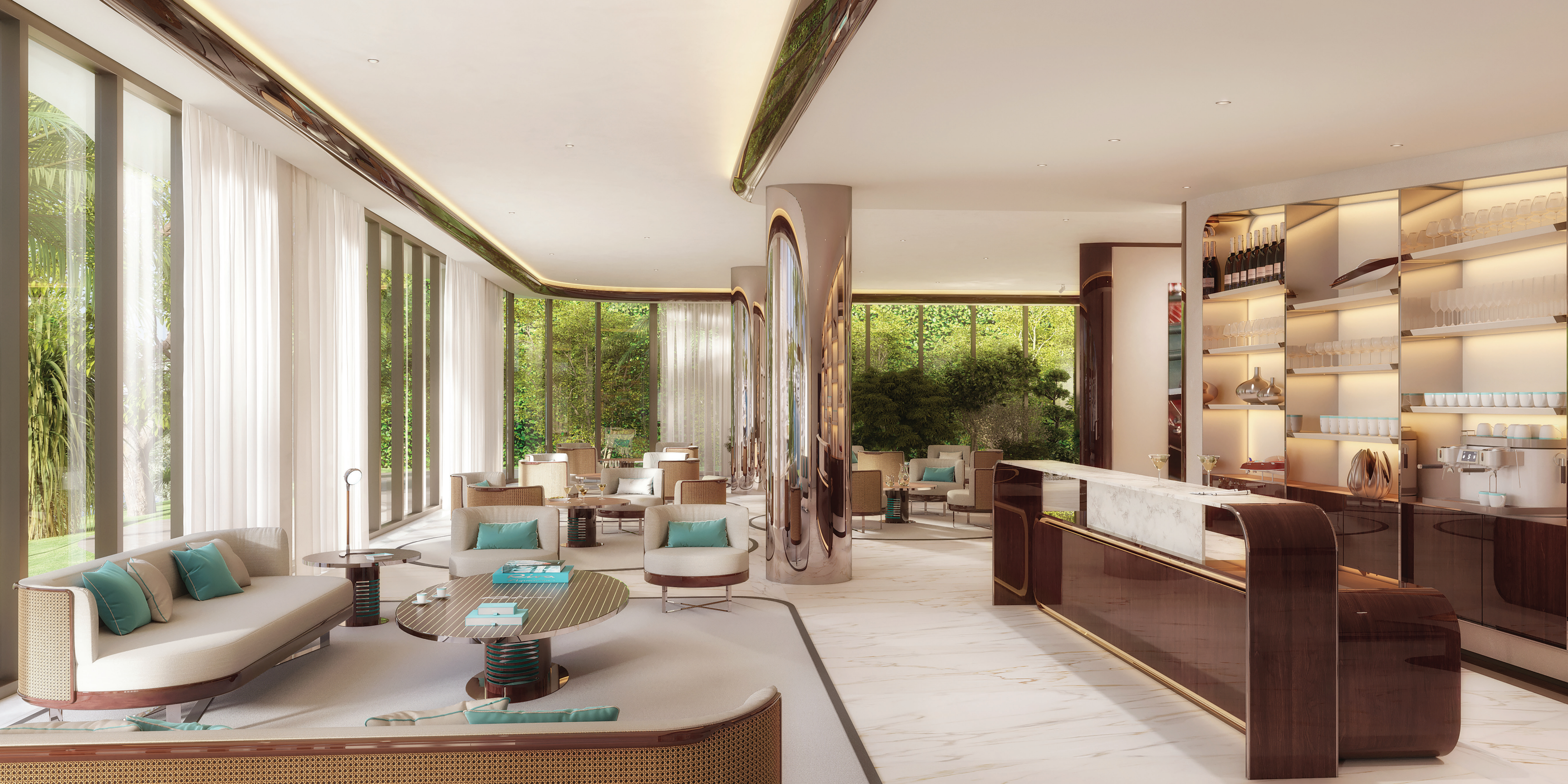
Spacious, inviting ground floor lobby and bar set the stage for intimate gatherings and meaningful conversations